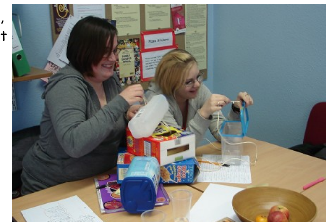
Getting stuck into making the instruments!