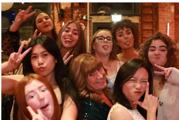
Puffins Awards Party 2023

There were also other awards given out and the categories this year included: Team of the year, Manager of the year, Deputy of the year, Apprentice of the year and a Practitioner of the year for each of our rooms.